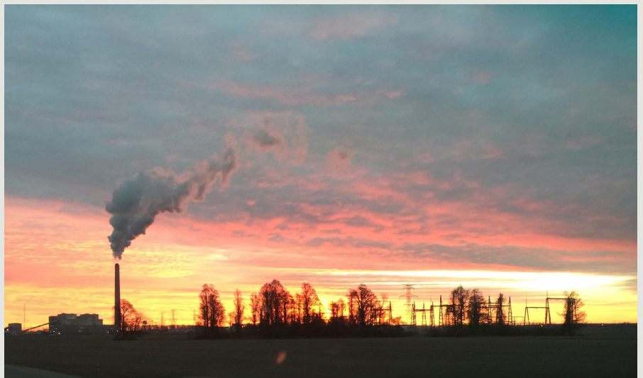
Traditional large-scale power suppliers such as coal and nuclear plants are being closed and replaced by alternatives on a much smaller scale.

Electric cooperatives and others in the energy sector will continue to develop renewable options and pursue new technologies. But absent, new large-scale alternatives and advances in energy storage, the stalwarts of today's energy fleet—coal and nuclear energy